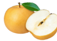
LOCALLY GROWN ASIAN PEARS